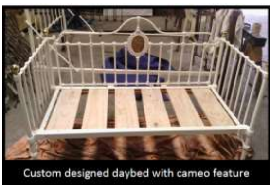
Custom designed daybed with cameo feature

In a small Queensland country town, a 13 year old boy was walking down the street past an old shed at the rear of the local pub, and noticed the publican was clearing everything out, amongst the rubbish were some old iron and brass beds. He asked what was happening, he was told the shed was going to be demolished and all the old stuff dumped. So he asked if he could take the beds and was told as long as he removed them all by the next day. So the boy went home, returning with his only mode of transport – his pushbike and set about the task of removing the beds and bed pieces – pedalling between the shed and his home taking them home piece by piece – as you can imagine quite a sight in a small country town, but by night he had the job done.