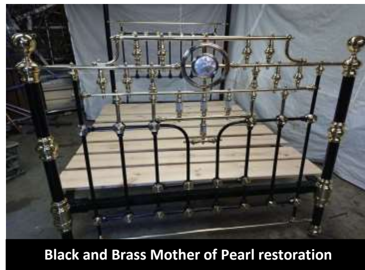
Black and Brass Mother of Pearl restoration

Thousands of brass and iron bedsteads were made, sold and then shipped about the world as people immigrated to other countries, where other brass and iron bedstead factories were begun. The Brass Bedstead Industry becoming so large, the employees were able to form their own Brass Bedstead Union to represent them. These artisans were mainly men, they worked in extreme temperatures and difficult conditions.